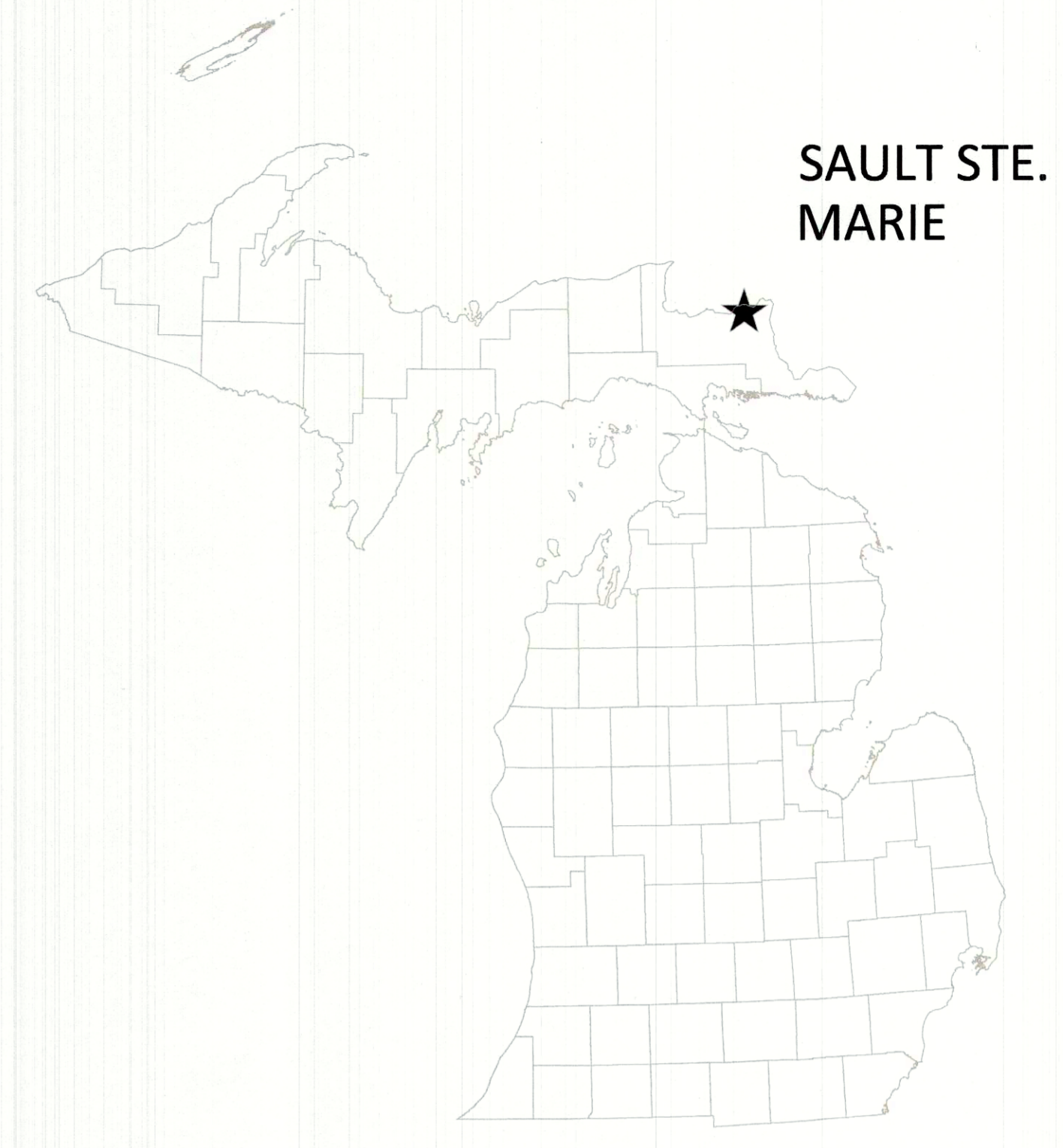
LOCATION MAP: NO SCALE